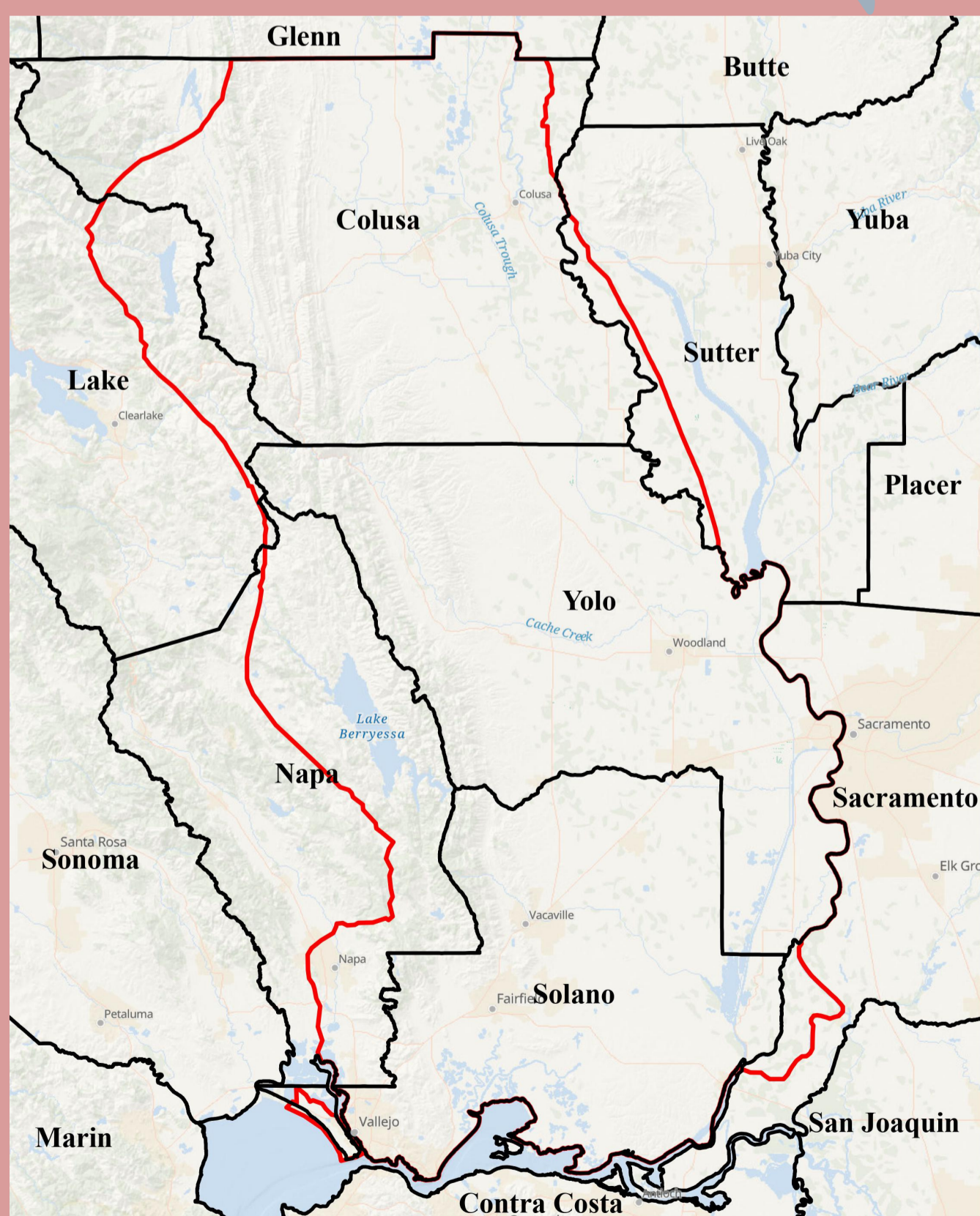
PATWIN TRADITIONAL TERRITORY

Approved by Yocha Dehe Tribal Council (July 23, 2019)